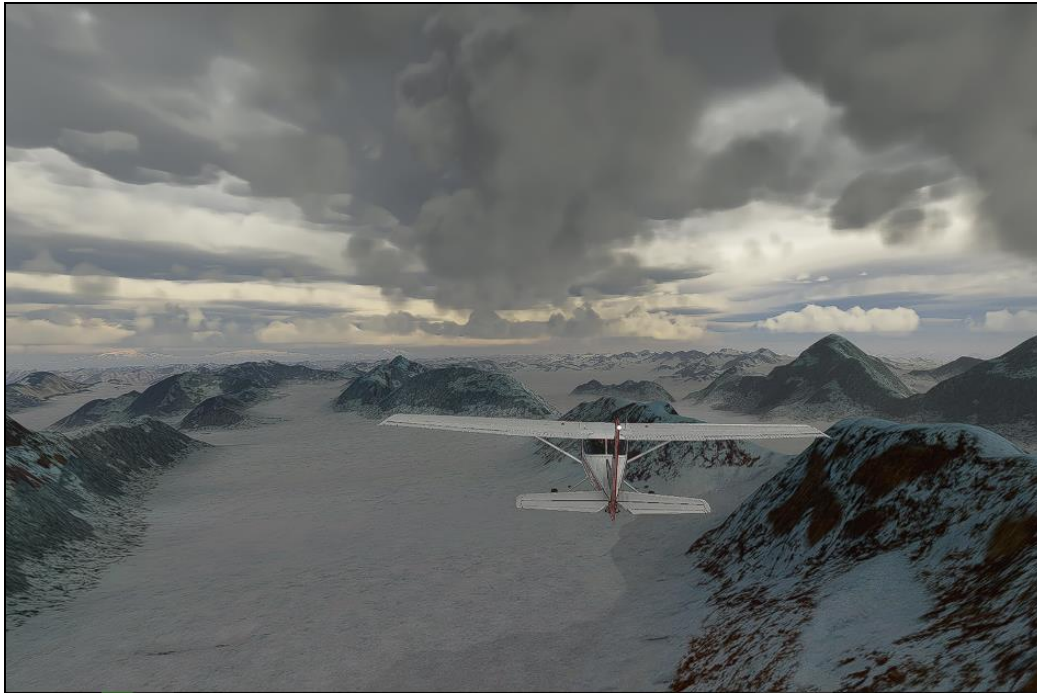
Hope all enjoy this MSFS expedition exploring some of the scenic and more rugged sites in Alaska.

Donate via Paypal paypal.me/nbrich1 if you wish but there is no obligation of any sort. My content will always be free for the flight-sim community.