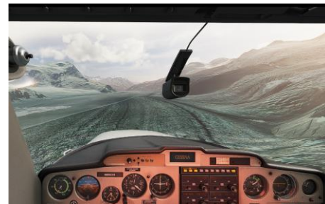
Valdez Glacier (Approach to PAVD)