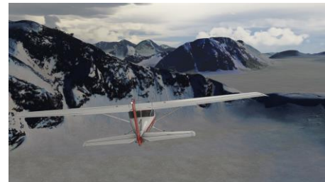
Approaching Valdez Glacier